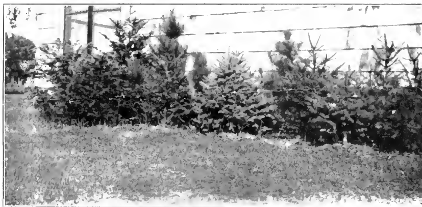
A Few of Our Small Trees Three Years After Planting

25 Trees, our choice, either American Arborvitae, Austrian Pine, European Larch Shipping weight: about 10 lbs.